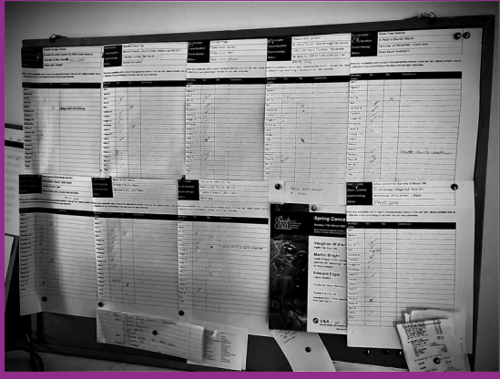
A snapshot of the PFC sign-up sheet board

For those of you with a friend or family member in PFC, you may have got the feeling you've not seen them much this year. It's August and we've already had 10 events and there's still 9 gigs to go, and the annual Christmas meal. Read on to find out what we've been up to