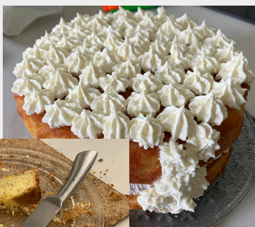
A trio of PFC bakes...