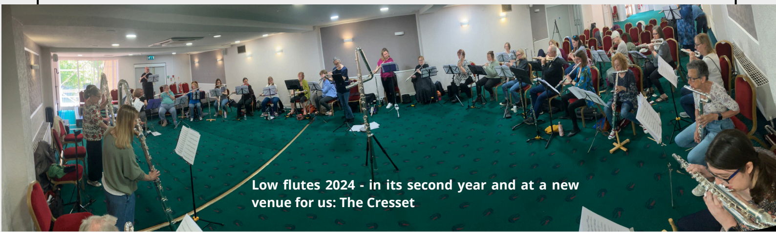
Low flutes 2024 - in its second year and at a new venue for us: The Cresset